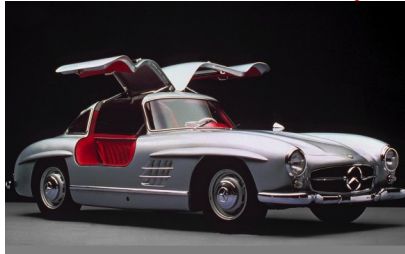
The famous M-B Gull Wing of the 1950's

Mercedes Financial (formerly Daimler Financial) has let us know that there have been several changes to the original concept. They are working on the details of the event and the proposed budget numbers.